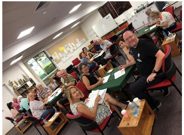
Lesson #2 SBC Saturday 4 Feb 2023